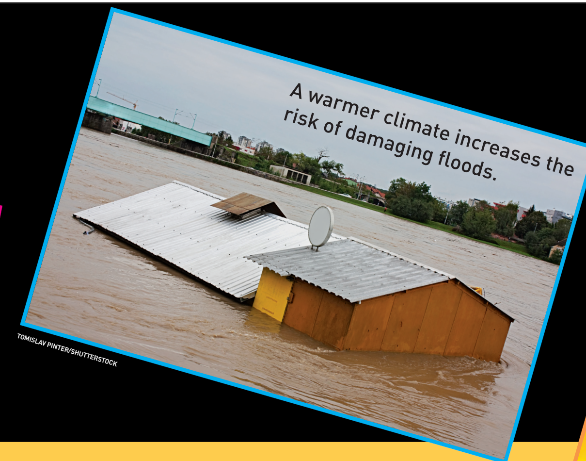
A warmer climate increases the risk of damaging floods.