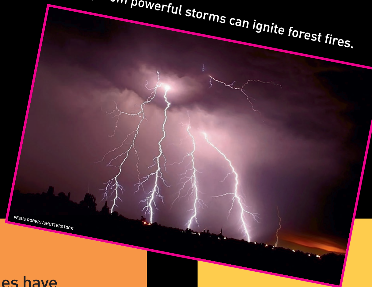
Lightning from powerful storms can ignite forest fires.