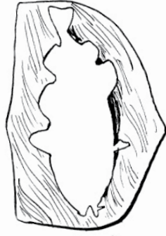
• ATLANTIC COD •

There are lots more fish that you could add to your chart. Visit the Marine Stewardship Council website to work out which fish are safe for you to eat. www.msc.org