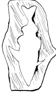
• HADDOCK •