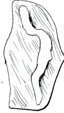
• EEL •