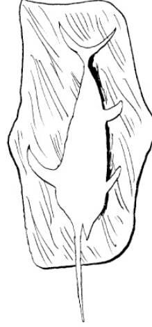
• SWORDFISH •