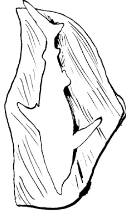
• SHARK •