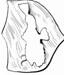
• MONKFISH •