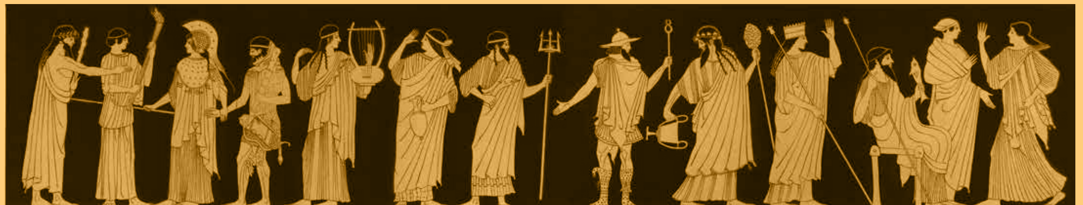
Athena Heracles Apollo Poseidon Hermes Dionysus Hera Zeus Hades

Hades: brother of Zeus; ruler of the underworld